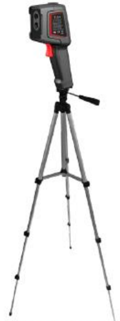
With standard tripod interface, can be equipped with customer's own tripod

T120H Thermal Camera is a fast temperature detection tool, which can be used to detect human temperature from a safety distance with accuracy of \pm 0.5^{\circ}\text{C} . It is an economical and practical thermal camera that could meet the needs of primary temperature screening well. T120H is not only suitable for flexible temperature screening, but also can be deployed at the entrances and exits of the public area, which makes it an ideal device to improve the efficiency of epidemic prevention and protect public health.